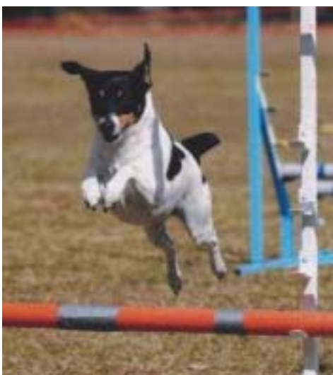
Fig 18 Agility upright hurdle