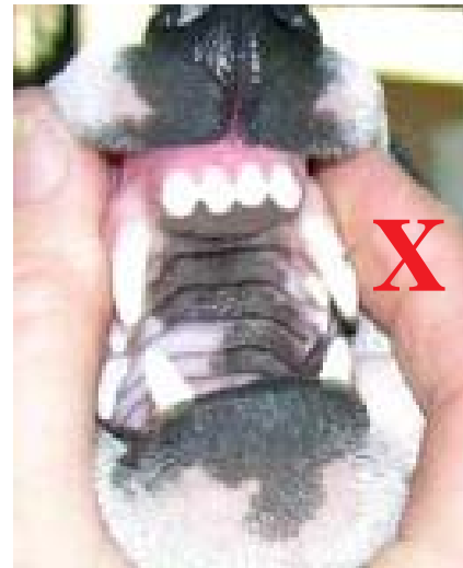
Fig 33 Four incisors in upper jaw

Incomplete dentition can be a problem in this breed.