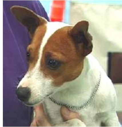
Fig 21. Tan & White Dog

Medium sized head in proportion to body. The head is only slightly rounded from ear to ear. Domed or apple heads are highly undesirable. When viewed from the front and side, head is to be wedge shaped and well filled in under the eyes (as in Figs 21, 22 and Fig 24). The stop to be moderate and when measured from that point to occiput it equals the distance from the stop to the tip of the nose with parallel planes (Fig 20). The colour of the nose is preferably black, with the exception of a true liver, which will have a liver nose. There should be strength in the muzzle.