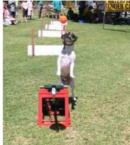
Fig 17 Fly Ball