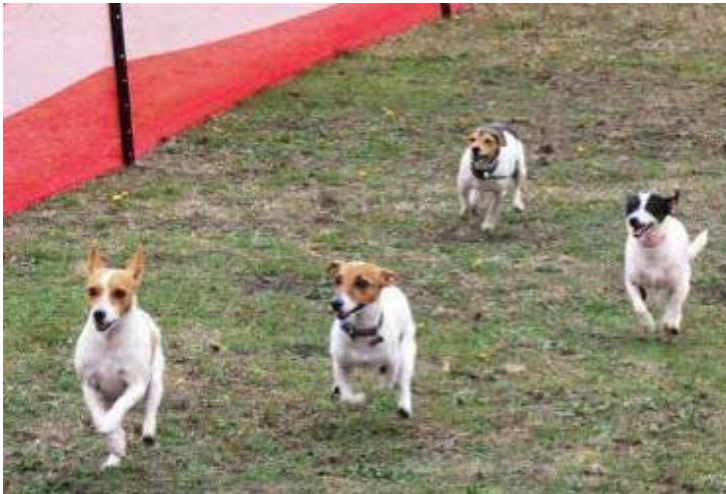
Fig 14 Lure racing