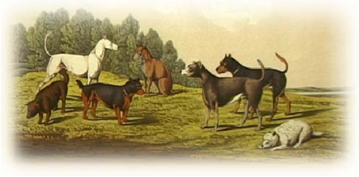
Fig 2. Various terrier types of the 1800's

Hence Terriers that specialised in killing rats came into existence. Rats carried disease for both dog and man and were a health threat to both country and city communities in the days before insecticides. Ratting terriers had to be quick and agile so that they killed the rat before they were bitten. These dogs were usually athletic, small in stature and smooth coated. As The rats being hunted generally lived in filthy conditions that would have become caked in long or rough coats, smooth coated terriers were preferred.