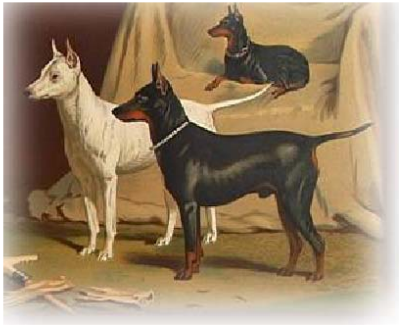
Fig 1. Old English White and Old English Black and Tan Terriers

The Tenterfield Terrier traces its origin back to the now extinct Old English White Terrier that was common in England as early as the 1700's. At that time an Old English Black and Tan Terrier also existed. These Terriers came in a wide variety of shapes and sizes as well as in a variety of coat types – from quite smooth through to rough or wire-haired.