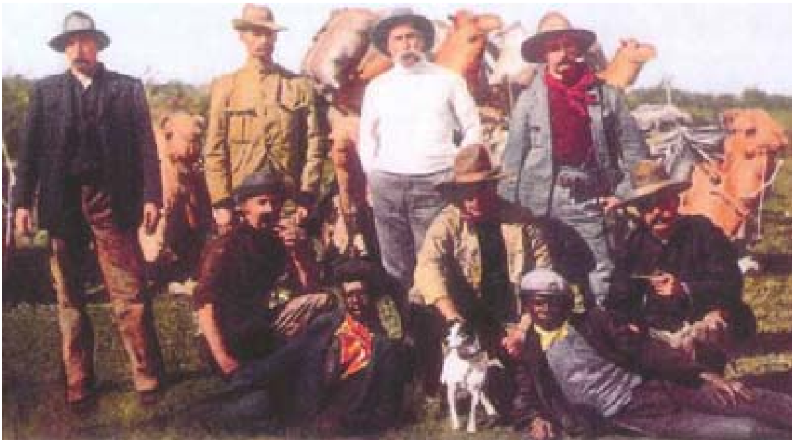
This police party travelled from Coolgardie to Halls Creek to search for drovers missing near the Canning stock route.