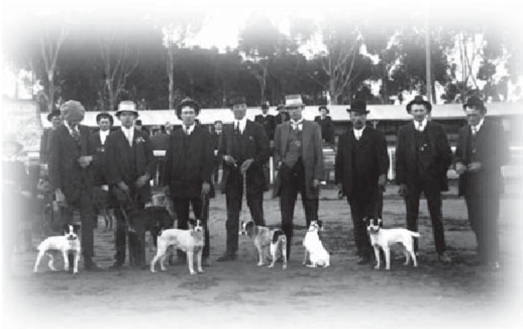
Fig 4. A hunting party probably in Western Victoria in the early 1900's

Small ratting terriers that were used to kill the rats and mice on board early sailing ships came to Australia with our first settlers. Once the ships docked, rats and other vermin escaped into our pristine countryside. Originally, many of these dogs would have been left behind specifically to kill this foreign vermin. But as Australia became more populated, these little dogs became established throughout the country not only as vermin killers, but also a popular family companions. These terriers became known as the "mini foxies".