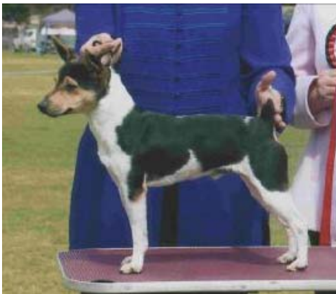
Fig 7. Tri colour