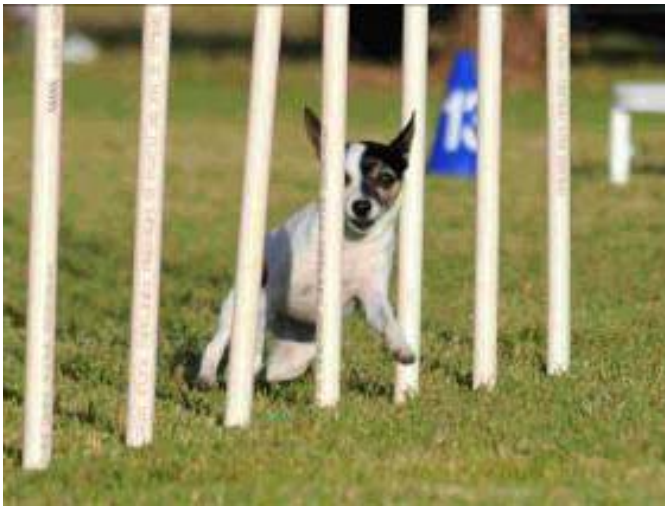
Fig 16 Agility weave