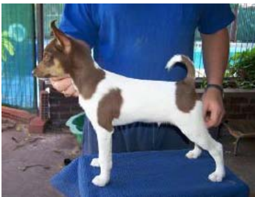
Fig 9 Liver tri