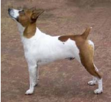
Fig 5. Tan and White

The Tenterfield Terrier is a strong, active, agile working terrier of great versatility and of pleasing proportion. The measurement of wither to ground and wither to rear point of buttock should be of equal proportions. The length of the head and neck should always be in balance to the whole of the dog. The coat is always smooth.