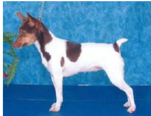
Fig 10 Liver tri

Correctly balanced adults and a baby puppy with different tail lengths in the three most common colour combinations. Note these examples lack exaggeration in any way including front and rear angulation, demonstrating the phrase 'of pleasing proportion'.