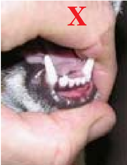
Fig 31 Five incisors in lower jaw

Strong jaws with full dentition and complete scissor bite, i.e. upper teeth closely overlapping the lower teeth. Lips to be tight fitting and pigmented. A wry mouth should be heavily penalised.