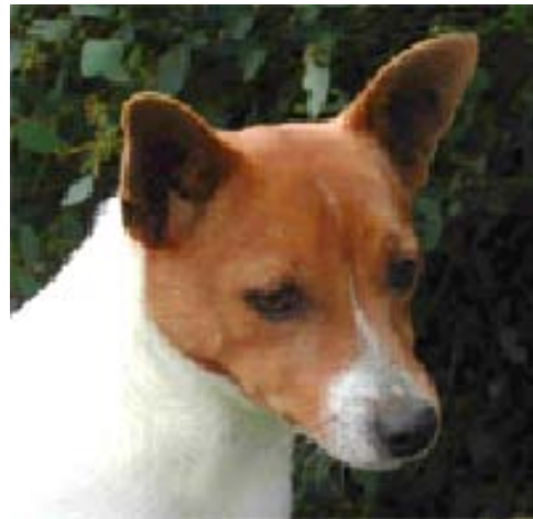
Fig 22. Tan & White Bitch