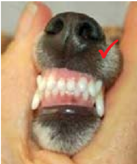
Fig 32 Complete dentition