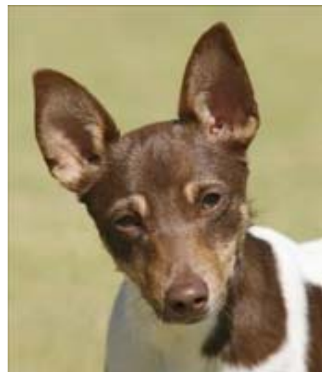
Fig 23 Liver Tri

Figure 23 is a liver tri Tenterfield Terrier with a liver nose and liver pigmented eye rims. Note that a lighter eye sometimes occurs in liver coloured dogs.