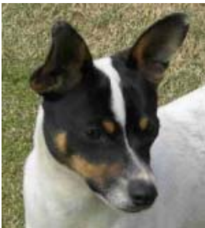
Fig 24 Tri colour dog