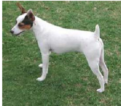
Fig 8. Tri colour