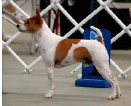
Fig 6. Tan and White