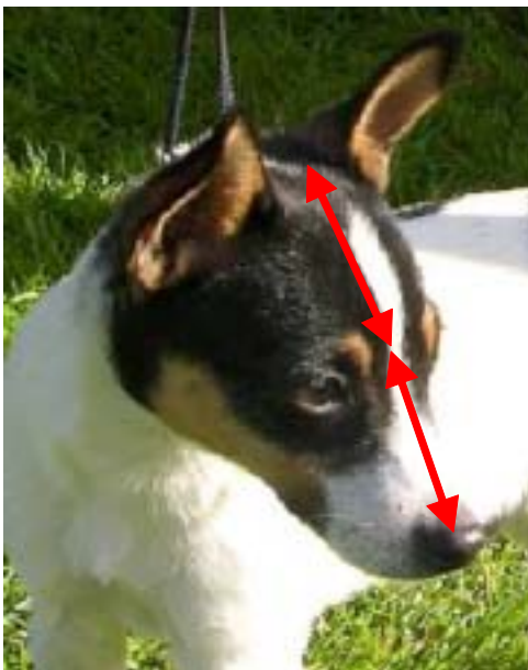
Fig 20. Parallel head planes