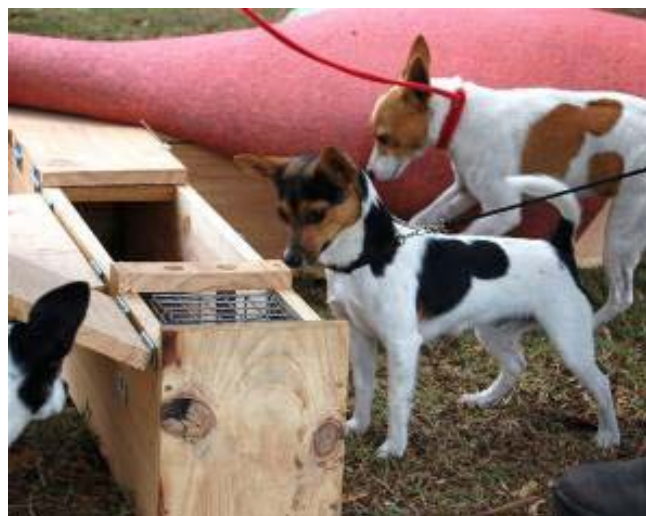
Fig 19 Introduction to Earthdog Activities