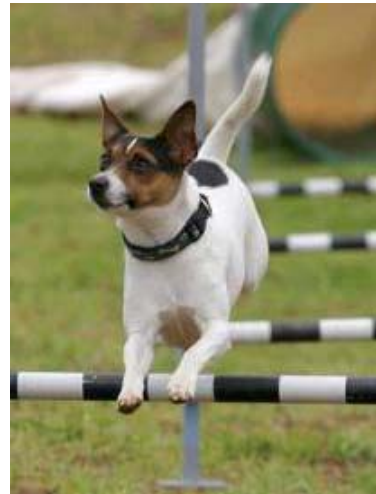
Fig 15 Agility spread hurdle